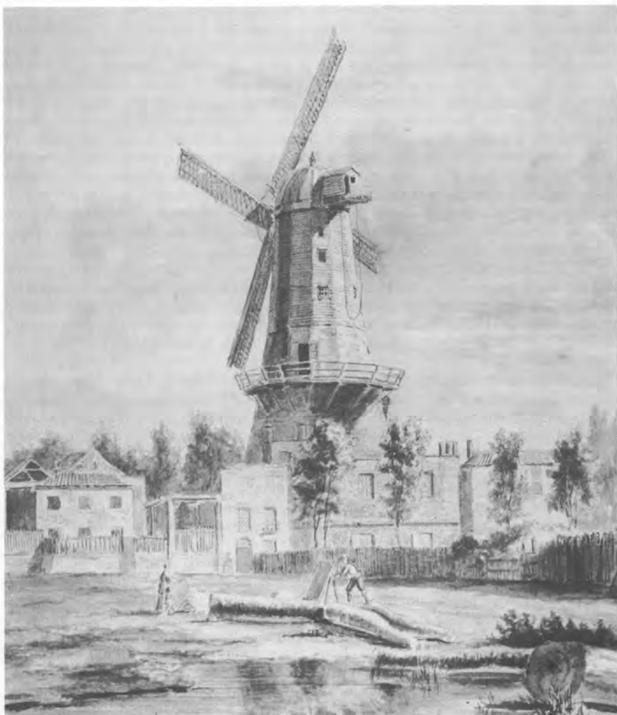
A Windmill near Vauxhall