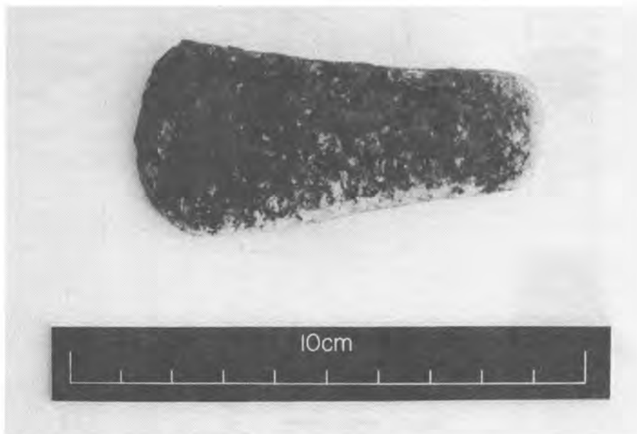
Bronze axe blade from Bagmoor Common.

more particularly the blade of a bronze axe. On first examination this looked like an Early Bronze Age flat axe, but on a closer examination it was possible to see a central longitudinal ridge and it therefore seems more likely to be the broken off tip of a palstave axe. It is 7.75cm long and has a maximum width of 3.9cm and is in poor condition. The SWT has donated the axe to Haslemere Museum, which is arranging for it to be conserved.