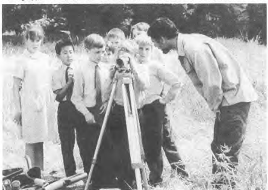
Ewell Excavation Open Day - lining up for a view.

The excavation can be regarded as a success in other ways too. It provided valuable training opportunities for the students and allowed local people to participate in the