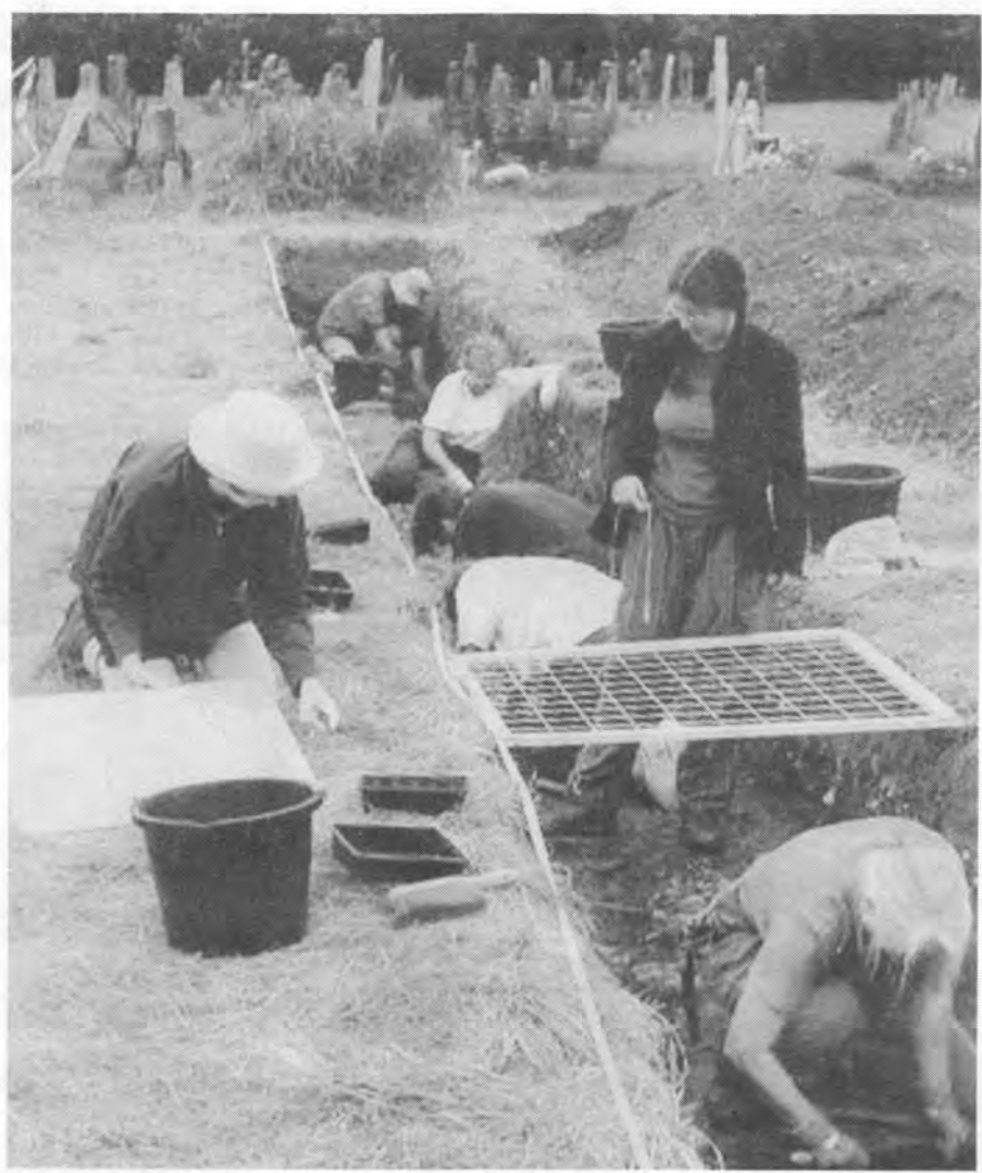
Excavation in Ewell, Summer 2000.