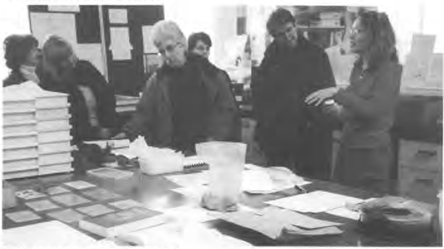
Society members at Fort Cumberland