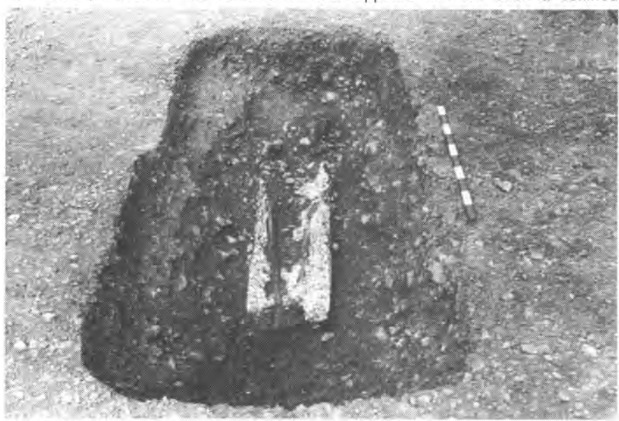
Park Lane, Croydon: Roman inhumation burial with an internal chalk lining.

A large, rectangular inhumation grave on the eastern margins of the site, oriented north-south, contained the remains of what appears to have been a coffined