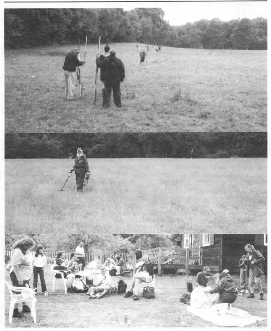
Detecting Survey at Ewhurst