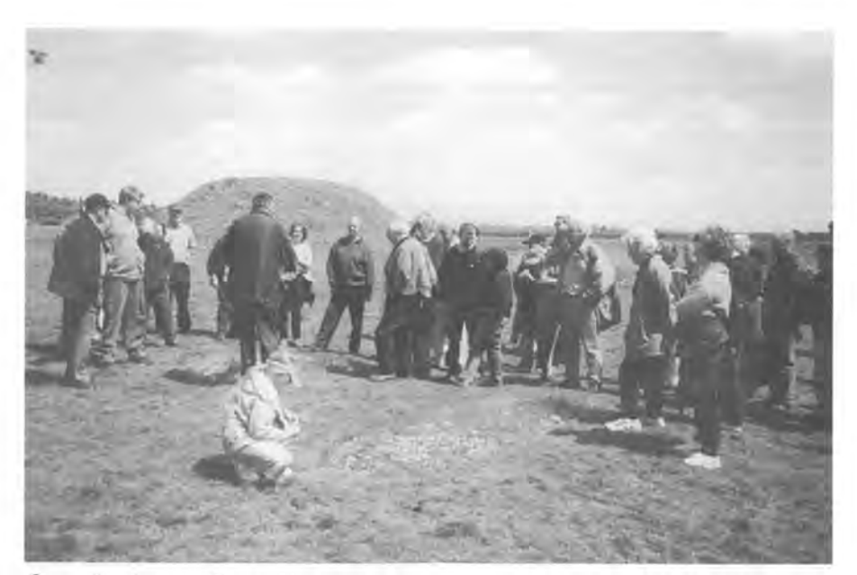
Our guided tour at Sutton Hoo

them so that it will eventually be possible for them all to be seen where they were first found.