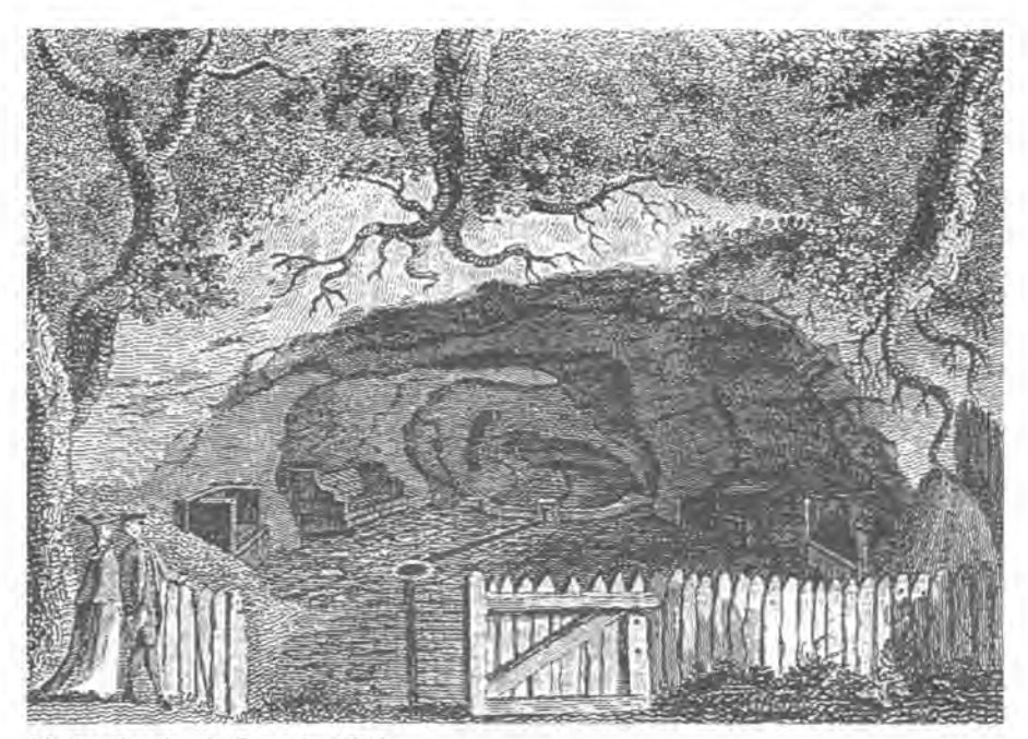
Mother Ludlam's Cave in 1773

that an original narrow void cut by the spring was enlarged in the 17th century to form a grotto, as one of the features within the landscape around the house.