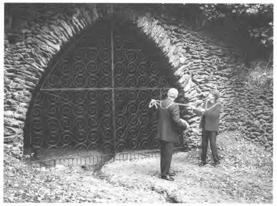
The 'Closing' of the Cave

Earlier in the year I reported on the results of the Society's test excavation in Mother Ludlam's Cave, near Farnham, in advance of the insertion of a new grill and gate ( Bulletin 360 ). This has now been fitted and the borough and town councils kindly invited members of the excavation team to attend a small ceremony to mark the event. The photograph shows the Mayor of Waverley and the Mayor of Farnham officially 'closing' the cave – the opposite of what one normally expects from such events.