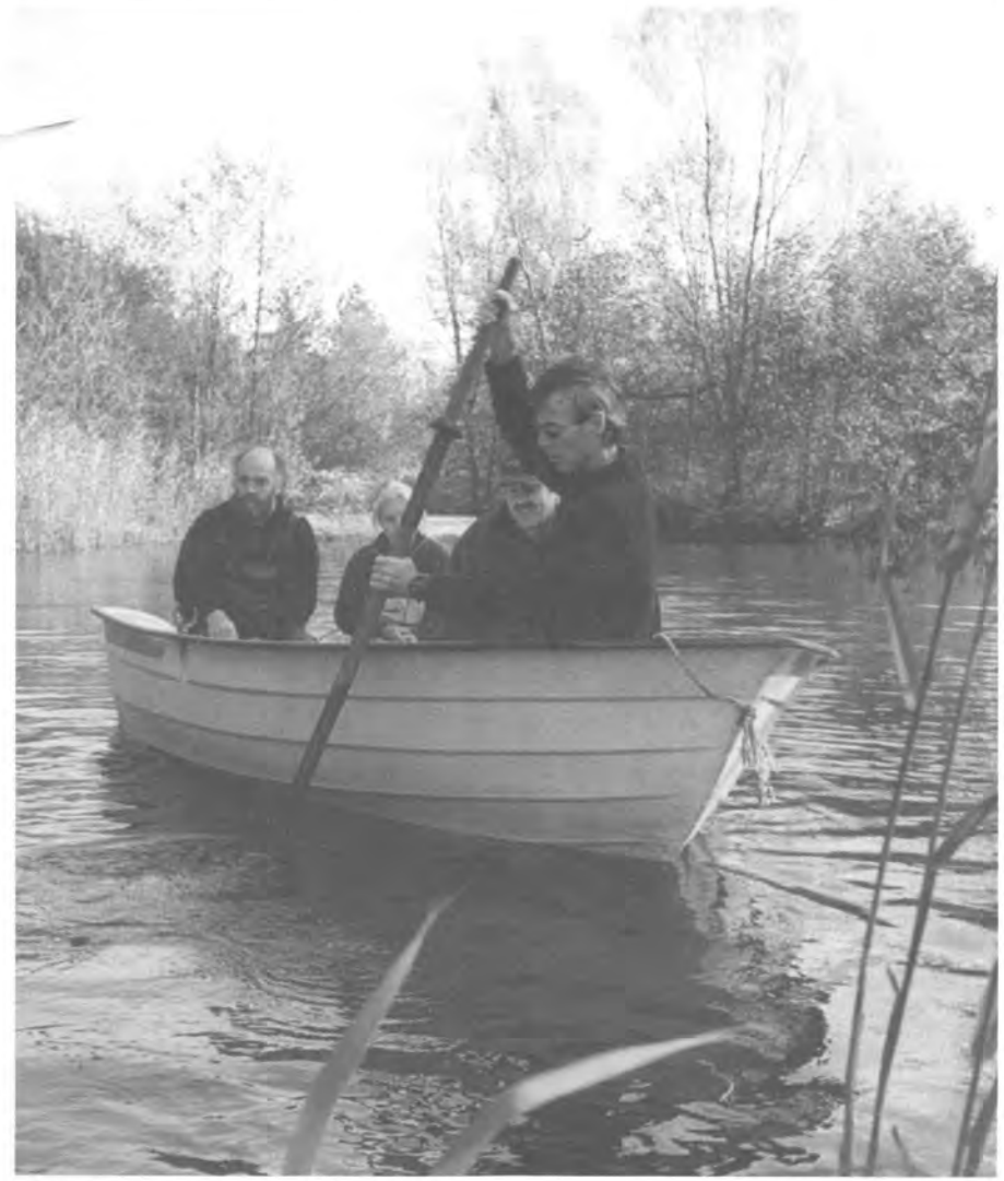
A Dam at Little Pond?