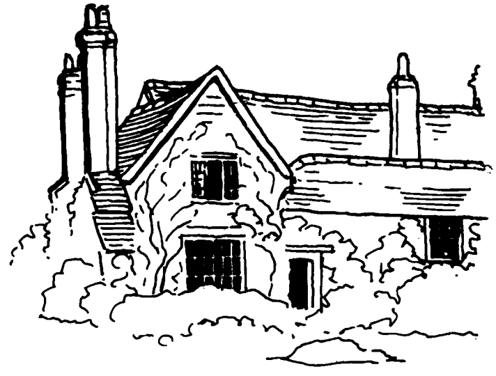
Anonymous drawing and lithograph

My attention was recently drawn to a map of Reigate engraved by Thomas Foot,