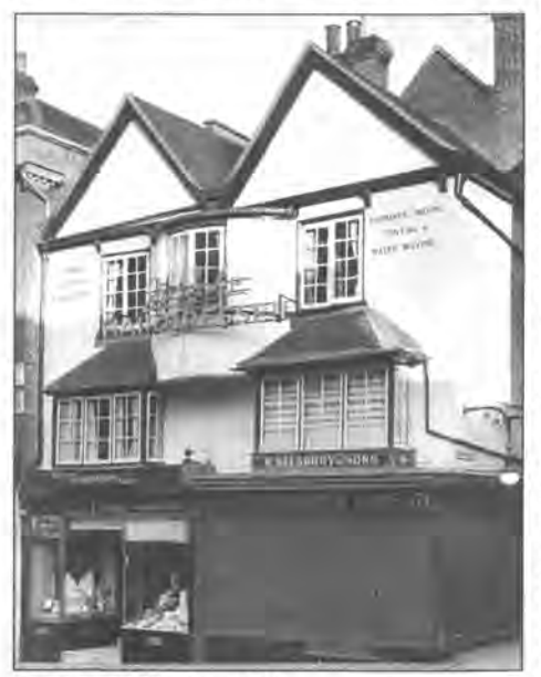
Salsbury's in the 1930s

An informal inspection of this building was carried out in 1995 after the discovery of an intact medieval undercroft beneath no. 83 on the opposite side of Swan Lane. There is a possibility that the Swan Inn, at no. 83 had extended across the alley that is now Swan Lane. No photography was allowed. The cellars of 81 are mostly of brick, however, with some bits of chalk. The main feature is the remains of bread ovens. A passage runs west from the cellar. It has been blocked up by Salsbury's, but is said to extend to no.73. No evidence for this was seen in no. 73 in 2002, but