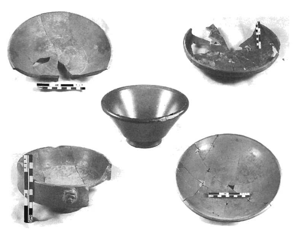
Samian tableware found in association with a stone-walled structure at Hatch Furlong in 1977