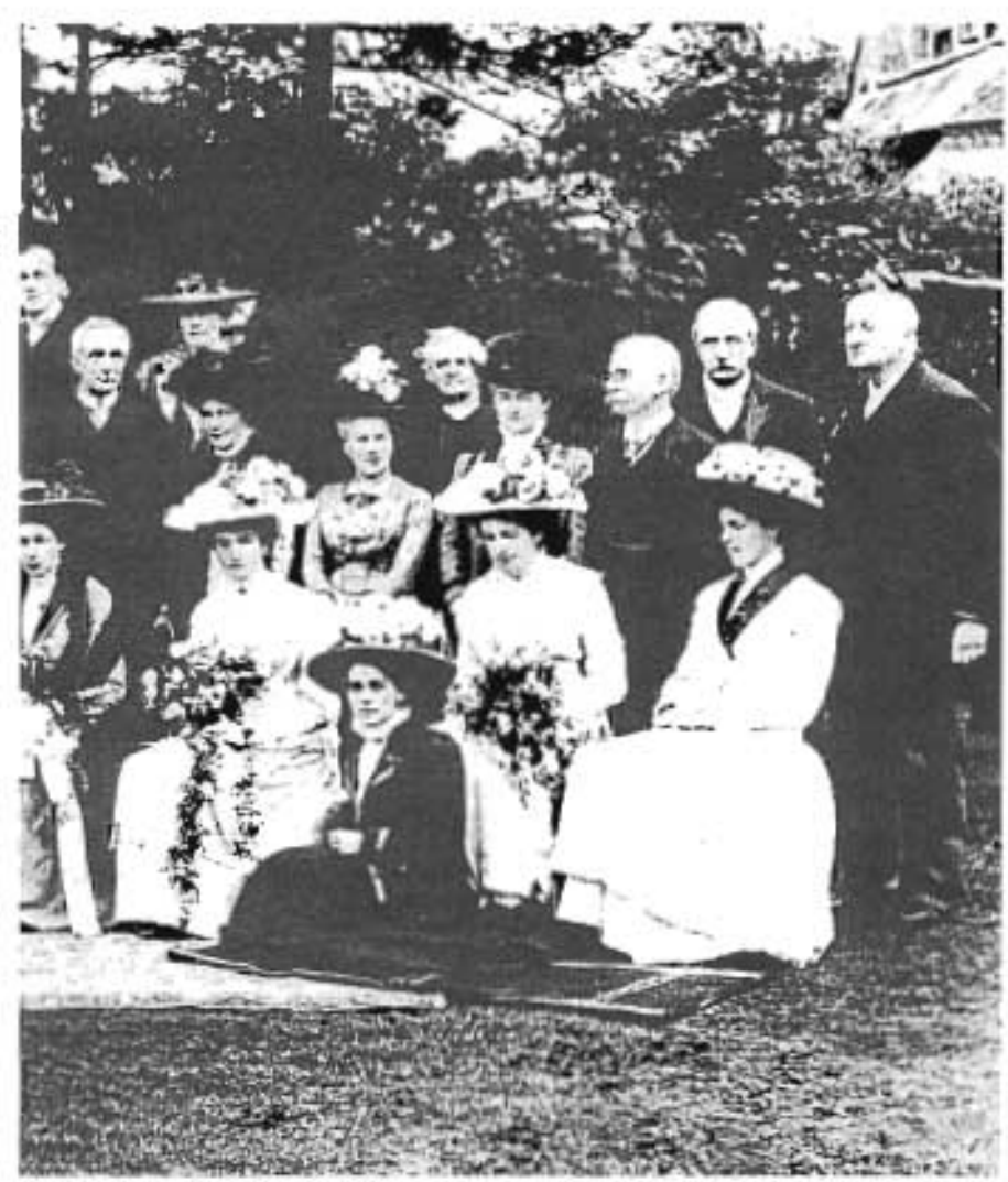
MISS HEATH OF ALBURY (SEATED FAR LEFT)