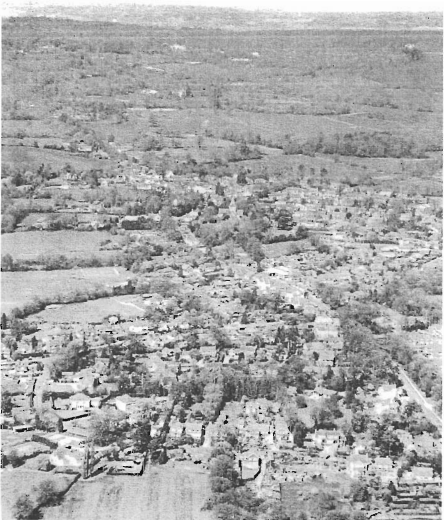
EWHURST VILLAGE FROM THE SOUTH (see p.18)