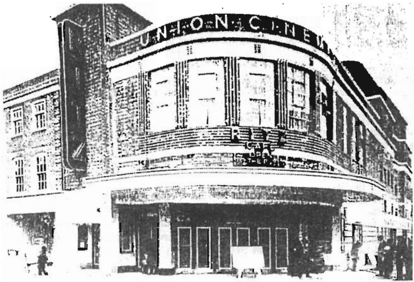
Ritz, Woking.