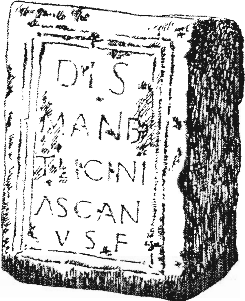
STONE OF MYSTERY. The Clapham Roman Memorial Stone.