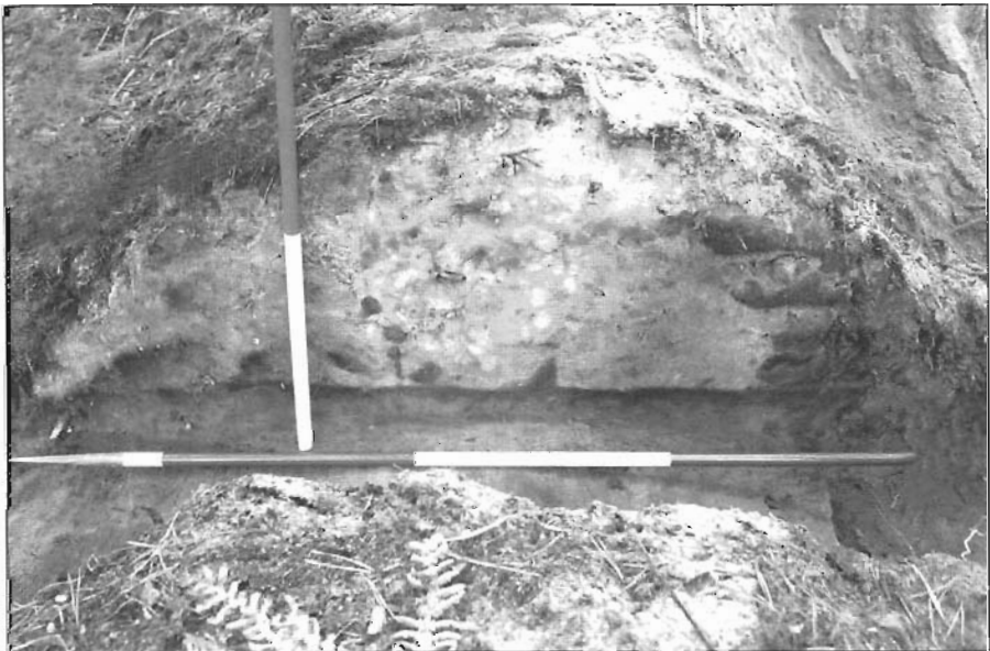
Cross-section through the bank; the turf wall is clearly visible on the right hand side

The parish boundary bank is c2m wide at the base and 0.6m high and is flanked on either side by 1.5m wide, still discernable, ditches. The line of the boundary is in all probability medieval but it is unlikely that the bank is of that date and more likely that it is either Tudor or late 18th century in origin. As the pine trees in this section of the property were due to be felled towards the end of 2006/early 2007 and it was decided to take the opportunity to cut and record a section across the bank, which was at risk of being damaged by the forestry contractors' heavy machinery.