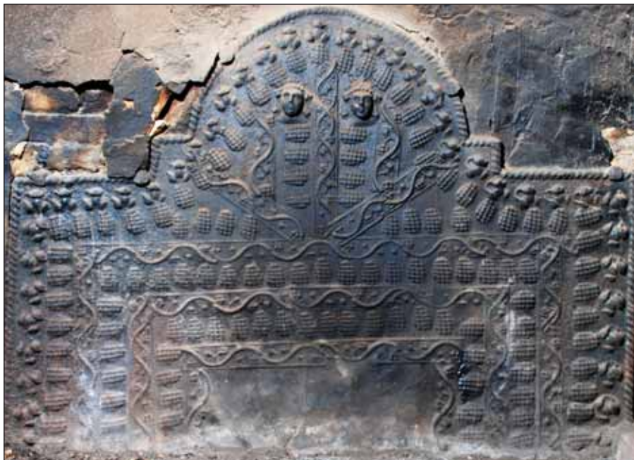
A 16th century Wealden Fireback at Grayswood, Surrey

Studies on the subject have been written in Germany, France, Norway and even America, but not in Britain.