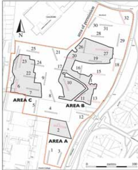
Fig 1: Plan of site

In January 2007 an evaluation by SCAU staff took place at Christ's College School, Guildford (SU 9918 5173). The fieldwork took place ahead of development on the site, which consisted of the construction of new modern school buildings, as well as a completely new school for children with learning difficulties (Pond Meadow School).