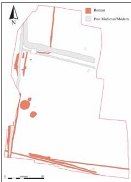
Fig 3: Area C

proposal area was carefully machine stripped and a record of the archaeology within the top and subsoil made, which included a further later Bronze Age flint scatter.