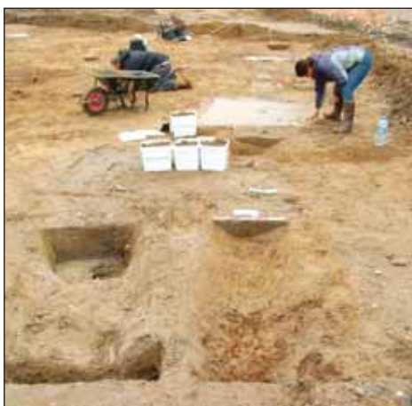
Christ's College School environmental sampling