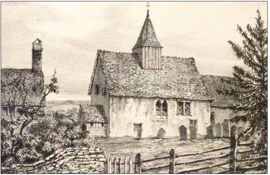
Drawing of St Peters Church, Hambledon by Cracklow in 1824