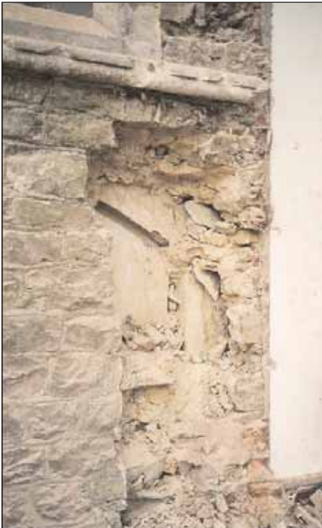
Hambledon Church. Exposure of north chancel wall

The result was inconclusive and the number of finds recovered was small: those from Trench I included Bargate and Horsham Stone building material, including one virtually complete Horsham Stone roofing tile, which do not relate to the existing building. It is probable therefore that the foundations of the medieval north chapel lie under the north aisle of the present church.