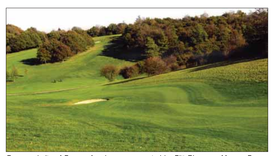
Presumed site of Bronze Age barrow excavated by Pitt Rivers on Merrow Downs (now Guildford Golf Course), to right of 2nd green in the distance and just behind second clump of trees to right.

A Bronze Age barrow was excavated on Merrow Downs by Pitt Rivers in 1877, which was briefly recorded and believed to have been to the south-east of Levylsdene and nearby Keeper's Cottage in Walnut Tree Bottom. This barrow 'contained a British urn' and may have been a short distance down the slope from what is now the second green on Guildford Golf Course (see figure).