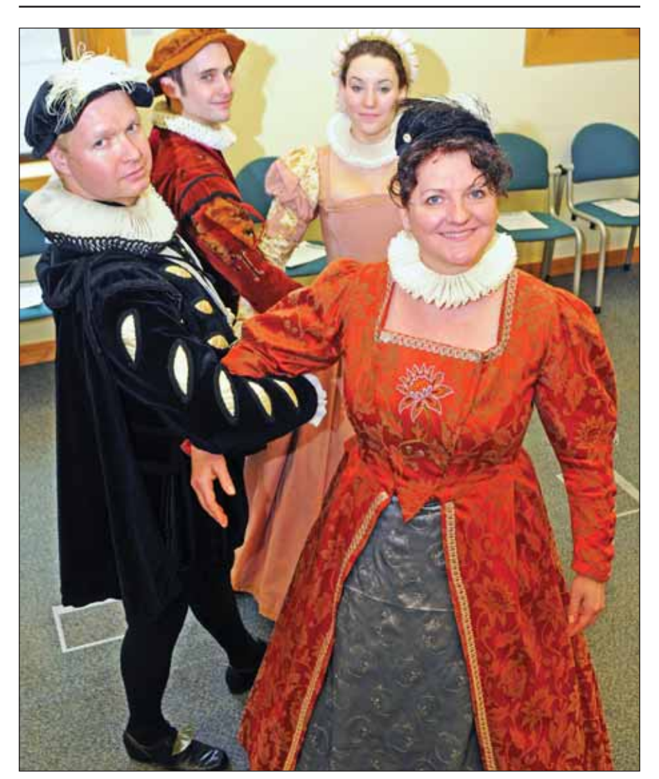
'STRUTTING LIKE A PEACOCK' (page 19)