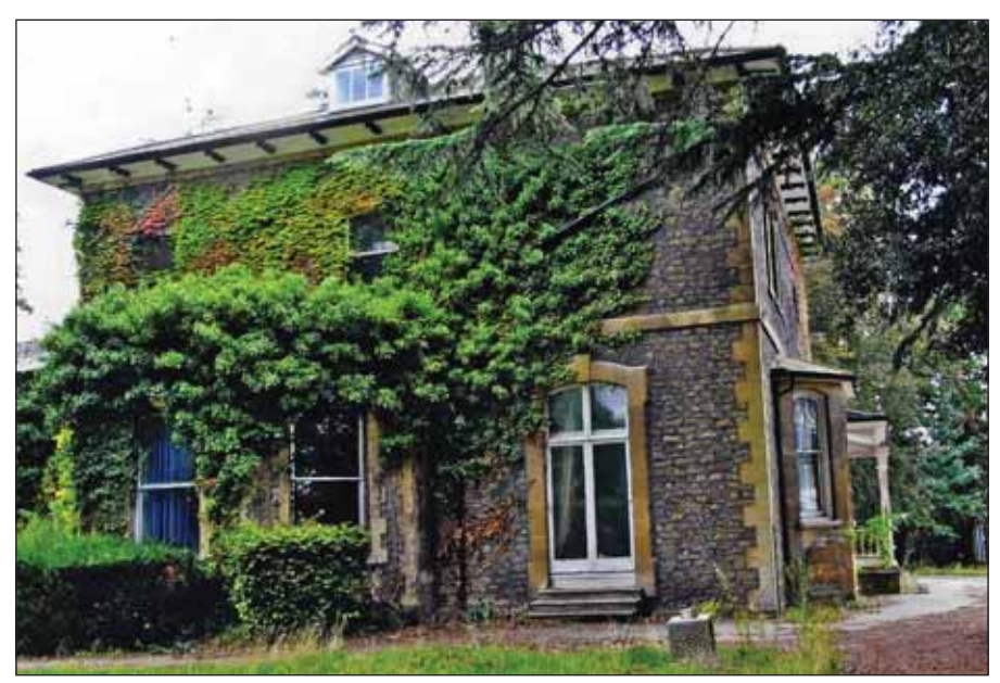
'Uplands', Merrow, Guildford.

interest among local residents when the site was sold for development in 2008. Linden Homes South West plan to build some two hundred homes on the site and to refurbish 'Uplands' to provide quality apartments. The house is currently in a state of dire dilapidation. The house kindled my interest too, because of its association with General Pitt Rivers, then Lane Fox.