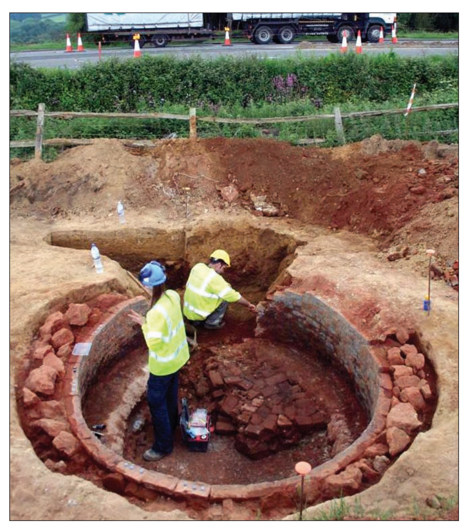
LIME KILN 1 ON THE A3 HINDHEAD ROAD Excavation and archaeomagnetic dating