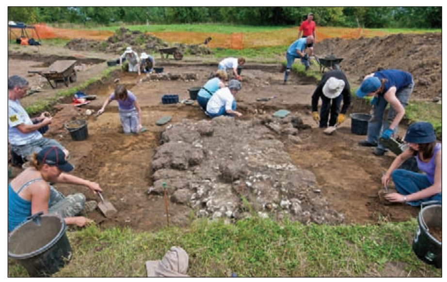
Woking Palace 2009. The walls of the medieval building were constructed with facing stones of ferricrete, a type of stone not found in walls of later date.