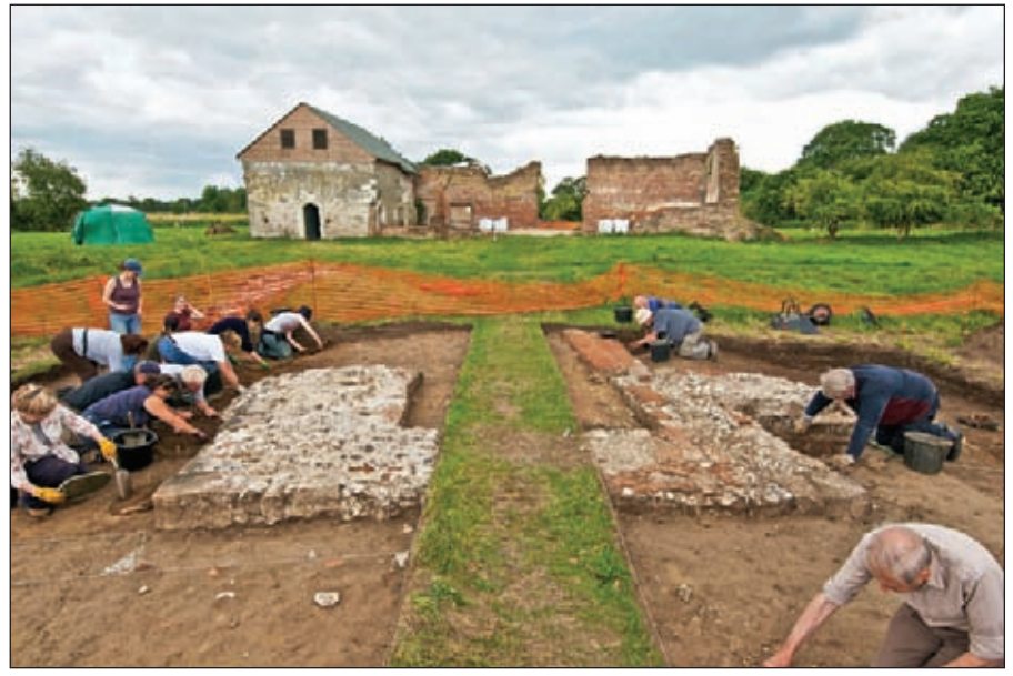
Woking Palace 2009. The porch of the great hall, with the surviving stone and brick buildings of the palace in the background.