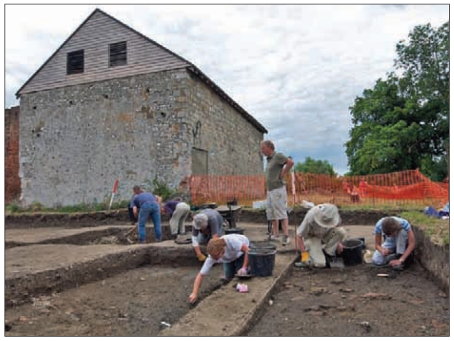
Fig 3 Woking Palace 2010: Excavation of the midden area in trench 6, behind (west of) the late 15th century stone building.

These latter areas formed two of the principal foci of the 2010 excavation (fig 2). The kitchen refuse in trench 6 (fig 3) revealed substantial amounts of animal bone and pottery which showed that it was being deposited in the late 13th or early 14th century. The bone includes foods only eaten by people of high status, including deer, wild birds, and lamb. This important collection is to be studied at the University of Nottingham. The refuse was sealed and preserved below the floors of a new range of stone buildings, erected around 1300, that seem likely to have been part of the privy lodgings (frontispiece). A few metres to the north, in trench 10, a number of hearths were identified. They were constructed using roof tiles laid on edge (fig 6) and undoubtedly belonged to the principal manorial kitchen, and seem to have been taken out of use around 1500. It is uncertain how early they were in existence.