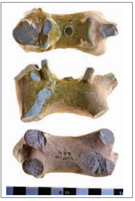
Fig 5 Woking Palace 2010: A ceramic toy horse of later medieval date.

The excavation was only possible as a result of the efforts of a large number of organizations and individuals, who