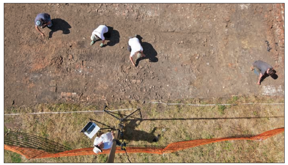
Fig 6 Woking Palace 2010: Overhead view of tile-on-edge hearths in trench 10 being cleaned.

laboured hard and skillfully through the cold, wet, wind and occasionally heat of a typical summer. They all deserve enormous thanks, and the following may be mentioned specifically. Thanks are due to Woking Borough Council, the owners of the land; to the Department of Culture, Media and Sport (acting on the advice of English Heritage) for granting consent for work involving a Scheduled Ancient Monument (No 12752), and to those who took the lead roles in organizing and assisting the excavation work: most particularly Richard Savage of the Surrey Archaeological Society; Abby Guinness (the Community Archaeologist, supported by the Heritage Lottery Fund) of the Surrey County Archaeological Unit; Joe Flatman, County Archaeologist; and the Friends of Woking Palace for refreshments and much else. The technical expertise and assistance provided by Archaeology South-East (University of London), QUEST (Quaternary Scientific, University of Reading), and Surrey Archaeological Society was also hugely important.