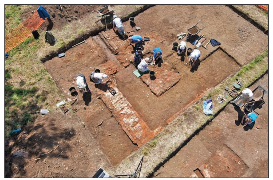
Fig 4 Woking Palace 2010: Tudor brick walls under excavation, with square core (newel) of the staircase visible.

A key part of the project was giving members of the public a chance to become involved in the excavations. In all some 155 adults and 140 children and young