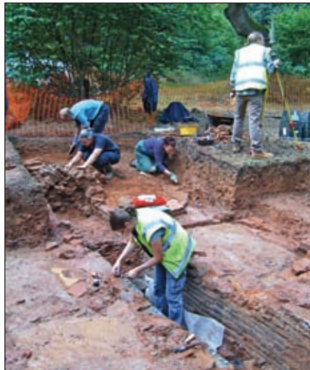
A very important part of the work this year was the gathering of samples for archaeomagnetic dating from the walls of the central flue of the kiln. This work was carried out by a team from the Museum of London.

The western extension of the trench successfully located the back wall of the kiln, but beyond it was a well-laid