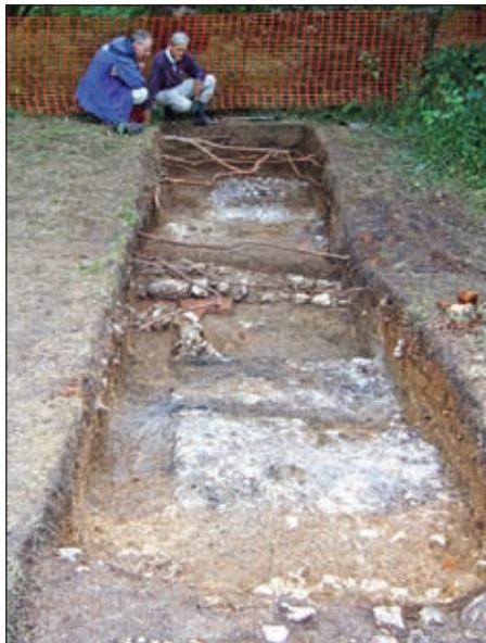
Trench 17 from the west with the early chalk level showing both sides of the later tiled gutter, whose outer wall can be seen. Part of its inner wall is also visible and a fragment of the east wall of the villa can be seen nearer the camera.

The south-east corner of the villa was tested by a new trench (17) laid out as a dog-leg in order to avoid tree and path constraints. The main aims were to test the area east of ('outside') the eastern gutter, to test an area of the corridor where Lowther (1929, 2, fig 1) recorded that the floor did not survive and therefore there was a good chance to explore earlier levels without destroying surviving archaeology, and finally to explore the area south of the gutter line to see if any more evidence for pre-villa structures could be located this far east (ie to follow up on the chalk floor evidence from Trench 8, further west).