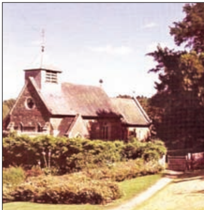
St. Peter's Church 2009