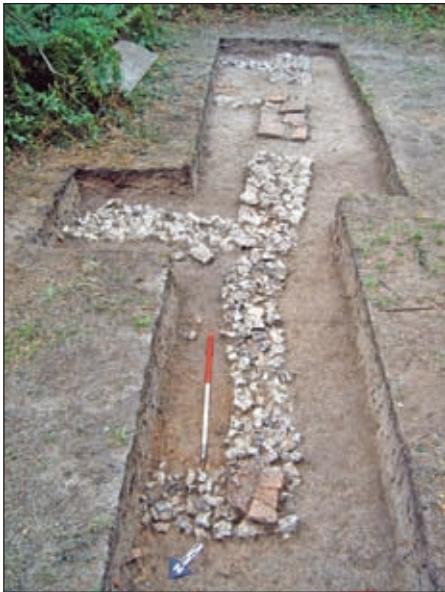
Trench 16 from the north showing the new building with its annexe (nearer the camera).

A new trench (16) was placed to the west of the villa to explore the results of fieldwork by John Hampton in the 1960s, magnetometry previously carried out by Archaeology South East and test pitting in the spring. The line of a well-built flint wall foundation was found but with an odd configuration: there were two well-finished gaps either side of a 1.72m stretch of wall which had a covering tile course. The gaps were of different lengths: 470mm and 610mm. At its north end the wall turned to the east, and within the small part of the trench available there were also two narrow internal walls. A narrower and more roughly built wall joined the main wall at its corner at a slight angle and it too had a turn to the east. It did not quite abut the bigger wall and at this end had a tile setting within it, while there was a tile pad at its corner. Probably these two tile features were bases for a post at the junction and a bigger one on the corner. Both sets of walls must have been intended as foundations for timber structures (there were very few loose flints and the walls survived too neatly to have been robbed). Finds included a considerable amount of pottery, some of good quality. One grey ware pot apparently smashed in situ may have been a foundation deposit