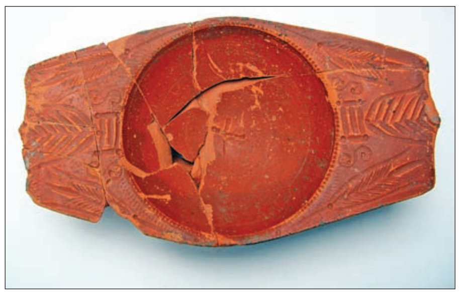
Samian patera from Flexford – made at Rheinzabern between about AD280 and AD340.

Hard-working metal detectorists again transformed our knowledge of the site. We have 60 small finds of iron, lead and copper alloy and their verdict is that there is no metal left in the plough soil. Diligent sieving produced a few more fragments of the so far unique samian patera found last year. These fragments were particularly important because they more or less complete the vessel and give a full picture of the decoration of which elements can be paralleled on other products from Rheinzabern.