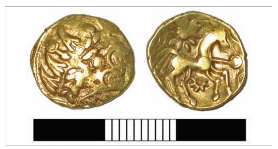
Uninscribed British Iron Age QC gold quarter stater.