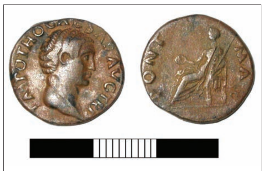
Denarius of Otho, AD69 reverse: Vesta PONT MAX.

Two Iron Age gold coins were also found: a Southern uninscribed British QC gold quarter stater struck in c 50-20 BC and a gold quarter stater of Tasciovanos struck in c 25/20 BC-AD 10. British QC staters are usually associated with the Atrebates and Regni, who are thought to have lived in south central England in the late Iron Age. Tasciovanos is usually thought to have been a ruler of the Catuvellauni. Given the location of the findspot, on the margins of the circulation of both Southern and Eastern coinage, it is unsurprising to find them together.