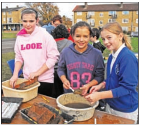
Young people help with finds washing on site

Archaeological Unit. Surrev Archaeological Society and the Preston Community Archaeology Project. managed to locate and uncover sections of the manor house itself and the chapel that served the wealthy families that lived there. The dig has provided us with important information regarding the location and positioning of these buildings, as well as the construction techniques and materials used. In addition, the team uncovered lots of interesting artefacts, including medieval roof tiles, a variety of glazed and patterned pottery and even the site of a human burial.