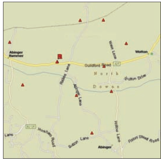
and any comments will be Roman sites within 2km of Abinger villa.

It should be stressed that the database will remain under construction and development as new information becomes available. A work of this size may well include errors in data entry and any comments will be