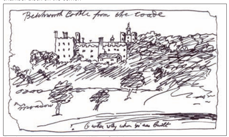
Betchworth castle: redrawn by William Stukeley.

Two early images of the castle survive. One, made by John Aubrey in 1673 (illustrated), shows it from the north with a large tower - interpreted as a chamber block - to the east (left) and a tall tower over a gatehouse to the west. The second image is a copy of a painting which once hung in the hall of the castle. This is a view from the east, and shows from left to right a range of reception rooms, a text-book great hall with roof lantern, ancillary rooms of indeterminate use and the large chamber block on the corner.