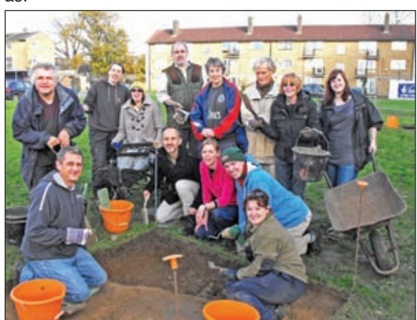
The Dig Preston Team on site.

'Camaraderie; the challenge to find something!' 'Participating in an event of historical significance literally on my doorstep. 'Getting involved with the field archaeologists and learning new skills' 'Doing something different and helping out.' 'The whole thing' 'Finding out more about the area and the history'