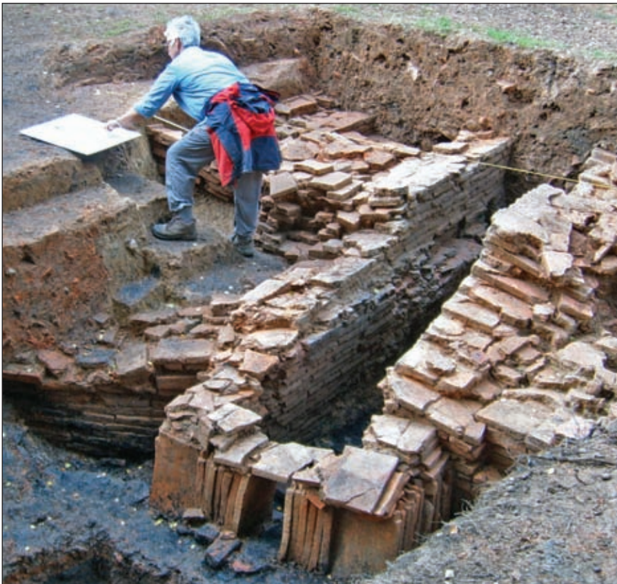
Stokehole end of tile kiln(s). The prominent ledge in the central flue marks the level at which the earlier flue was cut off and removed down to the base level of the later flue whose walls stand on top of it.

Two trenches were opened at the front and rear of the tile kiln(s), supervised by Nikki Cowlard. At the rear of the kiln more evidence was found for the tiled approach, presumably used for loading and unloading. There were relief-patterned tile fragments amongst the debris in this area. The tiled approach is an important feature