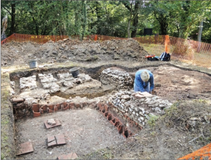
Room 6 in the foreground with Room 4 beyond showing the parallel underfloor channels; Room 7 to right.

occurred even though the wall and tiles were set on a strong foundation with a very thick floor make-up of flints and mortar. This floor served as the base for large hypocaust tiles with one broken pila tile still in place (see (Lowther 1927, pl 4 upper, opp 152; presumably he later removed most of them). There was some sign of burning on the floor towards the north west corner of the trench – ie roughly opposite the location of the furnace pit recorded by Lowther (rather tentatively shown on Lowther 1929, 2, fig 1, with a different version on Lowther 1930, plan opp 148). The surviving top of the wall had tiles clearly set into it that presumably marked the position of a door from room 6 into room 7. If so, this gives the floor height for 6 as being slightly higher than for 7 where the later floor survived (see below).