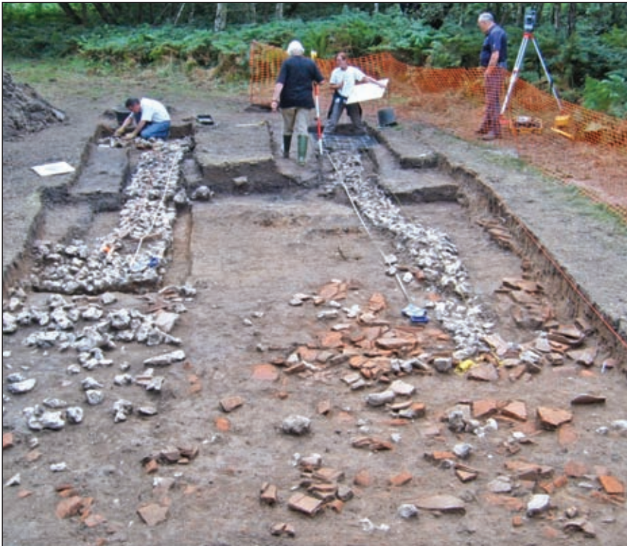
Work in progress on the new building.

Part of trench 16 over the new building was reopened and it was extended to cover the whole of the area up to the adjacent trench 18 which was also reopened. This work was supervised by Gillian Lachelin with some assistance from Frank Pemberton. A satellite trench was placed to establish the length of the main building, now confirmed as being about 7m x 14.5m externally. In this last area in particular there were hints of some earlier features. The annexe was traced a little further to the east but without satisfactory evidence for an end or a turn. The tile rubble noted running along north of the annexe wall was found to overlie it towards its eastern end and in this area it was noticeable that the line of the main structure was extended to the east beyond its corner by a flint rubble spread in contrast to the annexe where there was mostly tile. There was also widespread evidence for burning, some right up against the walls and therefore likely to be related to accident or demolition. The