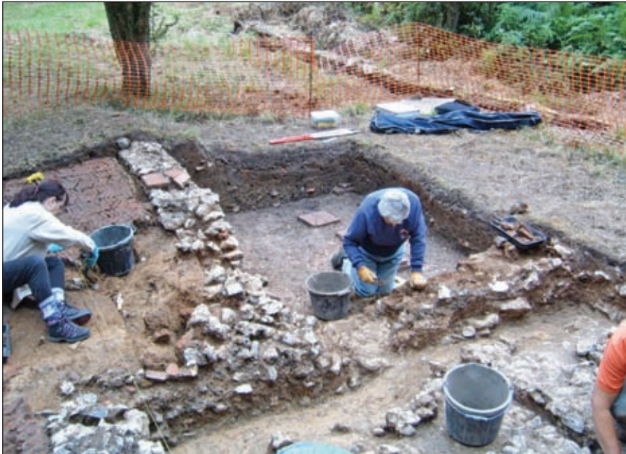
Work in progress in Trench 21. Room 4 in foreground with Room 7 to left and Room 6 beyond. The herringbone brick floor shows clearly and the disturbed nature of the wall line between the three rooms.

The herringbone brick floor in room 7 was found very close to the modern ground surface. It was not in very good condition apart from some patches but enough survived to confirm the three different patterns found by Lowther (1927, 152, and 146, fig 1; though not as regular as indicated on the plans). In one place the floor, with bricks intact, had slumped into a small depression, and it was generally uneven. It had been set on yellow clay with some mortar in places and was clearly a later reuse of the bricks. Where it met the best-surviving part of the wall between rooms 7 and 6 it had trapped some painted wall plaster (as previously recorded in a different part of the room by Lowther: 1930, 136). Traces of a lower floor level were noted and against the east-west wall between rooms 7 and 4 a better surviving piece showed mortar with tiles set on it (not much was visible but it was possible to see that they were not herringbone bricks).