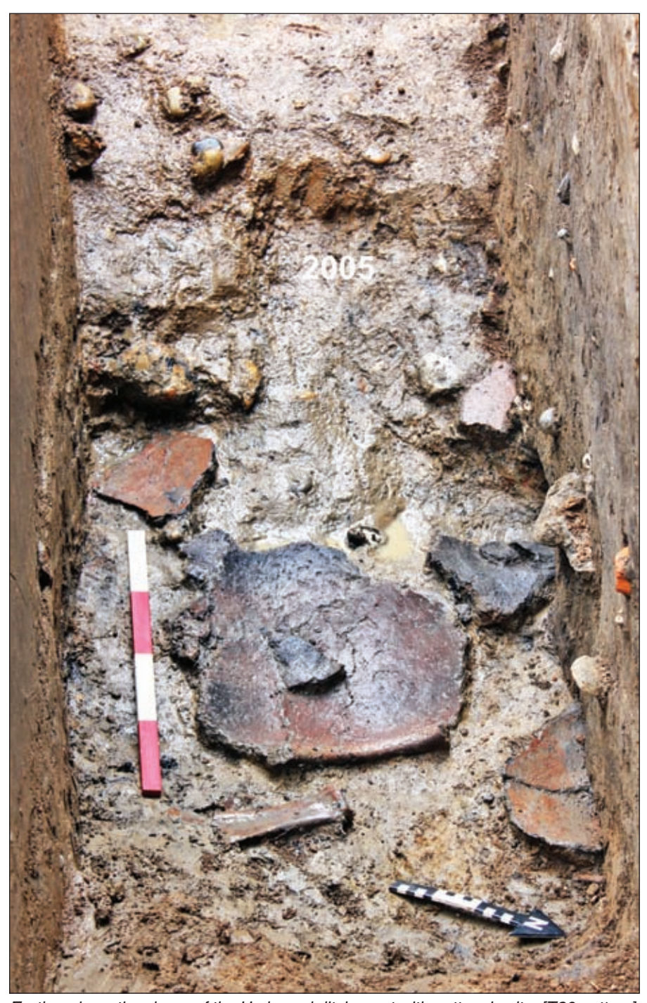
Earthwork section: base of the U-shaped ditch recut with pottery in situ. [T20 pottery].