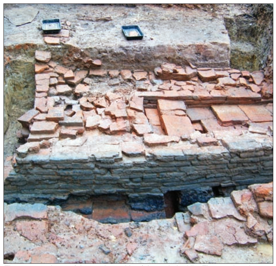
The excavated part of the southern side of the period 1 kiln. The openings into two of the side flues can be seen on the right side of the central flue and followed through by eye into the kiln structure beyond. They are obscured by the second period central flue wall, built onto the remnants of the first period wall and over the side flues. The kiln front wall to the left of the side flue has a thin inner wall lining intended to take the end of the firing chamber floor. [104].

Further work on the tile kiln made clear that there were actually two kilns, one on top of the other. What was thought last year to be a narrower lower central flue was in fact the result of the way the first period flue had been chopped across at a point where it had already begun to curve over; the later flue was built up on top of this (perhaps explaining why its walls had slumped outwards) and over the ends of the remnants of the earlier side flue walls. When the yellow clay packing was removed from this area it was found that what had been taken as a rough tile base for the packing was in fact the remains of the side flue construction for the first kiln. These flues had been made by building up the area with continuous tile packing and 'growing' the side flue walls out of it as they rose higher than the inclined floor of the flues proper. The outer walls of the kiln as they survived were probably those of the earlier kiln except at the western end (the back of the kiln. The end of tile production on site can probably be placed in the early 3rd century, as the last firing of the upper kiln is dated within the range AD 205-225, at 95% confidence (Noel 2011).