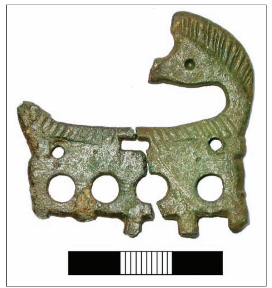
Roman military-type buckle from Artington. Scale in cm.

As well as the coins, two joining fragments of a buckle of Hawkes and Dunning's Type IIB (SUR-322AD4) were recovered on separate occasions from within the coin spread. Buckles of this form are rarely reported from Surrey and are usually thought to be associated with the late Roman military, perhaps c AD 340-410.