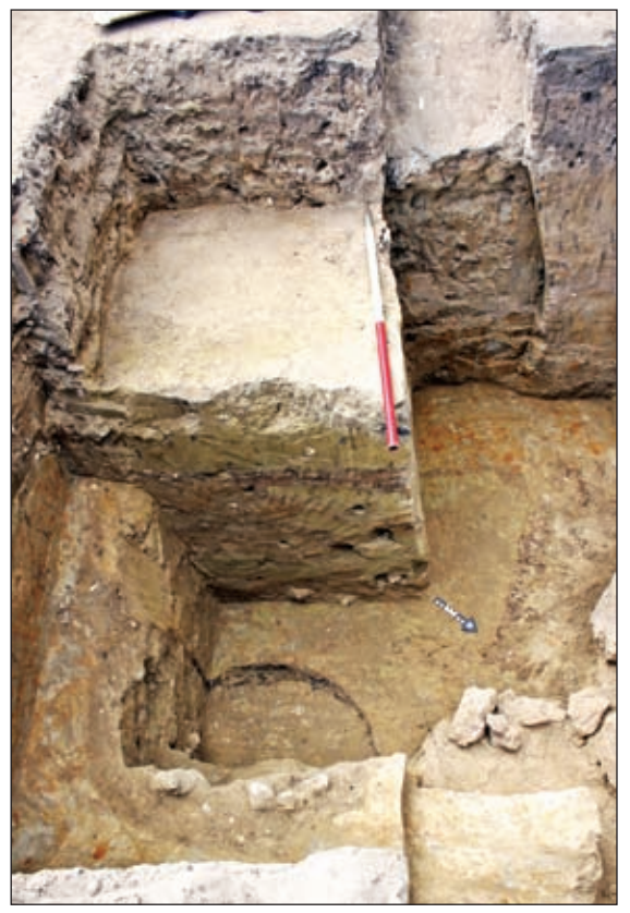
Looking south-west, with outline of earlier Roman barrel well to left of arrow, and cut for later Roman well to its right.

During initial machining a linear flint feature aligned NNE-SSW was identified in Areas I-J. It corresponded to the anticipated line of Stane Street but excavation showed it to be lying on/within disturbed soil, having been turned over by the deep ploughing. A metre wide section was cut across the flint feature at a right angle. and beneath the plough soil in J was a steep-sided subcircular pit about 1m in diameter. It was roughly halfsectioned and excavated to 1.4m. Augering suggested the fill extended a further 0.5m. and pottery and a mid 4th century Chi- Rho coin suggest a late Roman date for this feature. It has been mooted that this pit was a latrine, and environmental samples were taken for analysis. If the flint feature above it is roadrelated it suggests that the road at this point had already gone out of use by the late Roman period. Other features at this end of the trench included areas of pebbles, flint and chalk, and four postholes. includina one