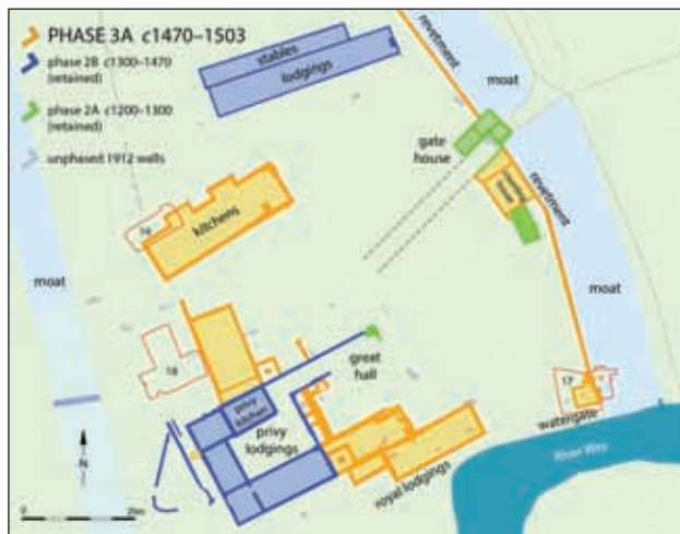
Provisional plan for Phase 3A (c1470-1503) of the manorial complex, when in the possession of Lady Margaret Beaufort, mother of Henry VII.

The next phase of development was not until 1574/6 when Elizabeth I had a new gallery built. The wall facing the inner courtyard was found to have a continuous brick foundation whereas the wall facing the river was built off a series of separate piers – these would have been linked by arches enabling the view across the Wey and its flood plain whilst being an effective means of dealing with the difficult soil conditions adjacent to the river. The building was primarily for leisure and recreation and was