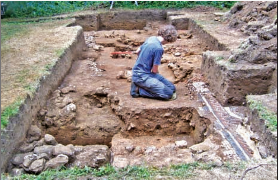
Trench 15 from the east; the figure is on the line of the robber trench of the main wall. A surviving part of the foundations can be seen in the foreground. To the right, part of the mosaic and beyond that the remnants of other floors.

Trench 15, under the supervision of Emma Corke, examined the area of the possible corridor to the west of the later, probably 4th century, range of rooms found in the 1990s. Much of the area along and on both sides of the main south wall had been robbed out to near the base of its foundation. No evidence was found for walls crossing the supposed corridor to match one found last year and therefore a corridor as such is confirmed, perhaps set between two end wing rooms. In one area a small portion of the opus signinum corridor floor survived, set on mortar over sand. It was possible to find and record evidence for two further north-south cross walls to the north of the main wall providing evidence for more rooms. Some information was also gained about their associated tessellated floors, which were slightly stepped up one after the other along the sloping ground from west to east. A small area of the mosaic found in the 1990s was exposed with a fresh piece alongside to provide a comparison in order to test how well it had survived reburial. It was found to be in good condition. Valuable information was recovered about the nature of the foundations of the main wall and the outer corridor wall.