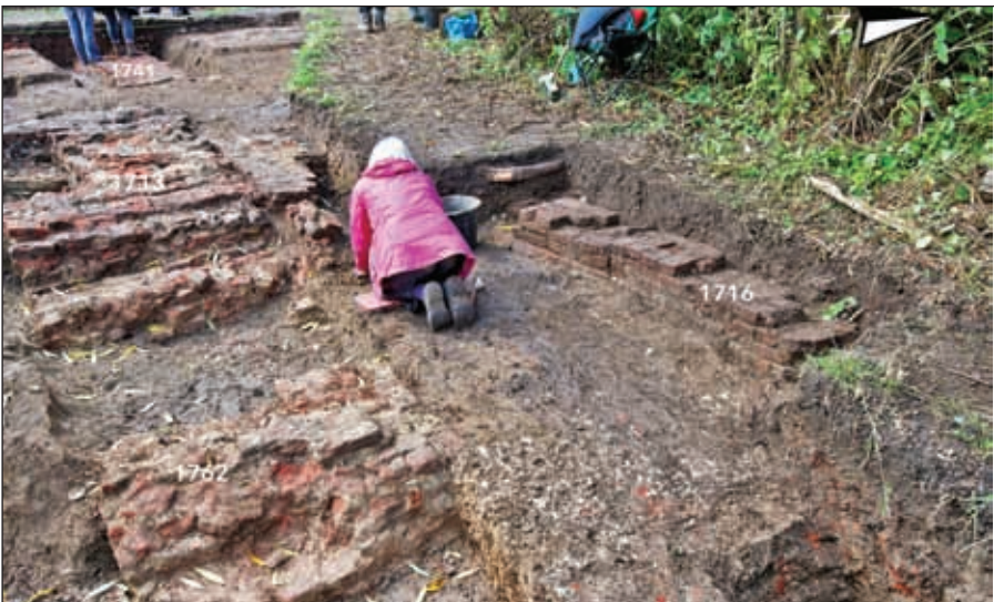
View of phase 3A contexts in trench 17, with the moat and brick jetty elements 1762 and 1716 in the foreground, and the north-east corner of the watergate (1713) centre left. At the rear is the foundation of the phase 3B gallery wall, 1741.

In the late 15th century a substantial rectangular brick building was created, after first stabilising the ground with massive amounts of flint rubble. It may have been well