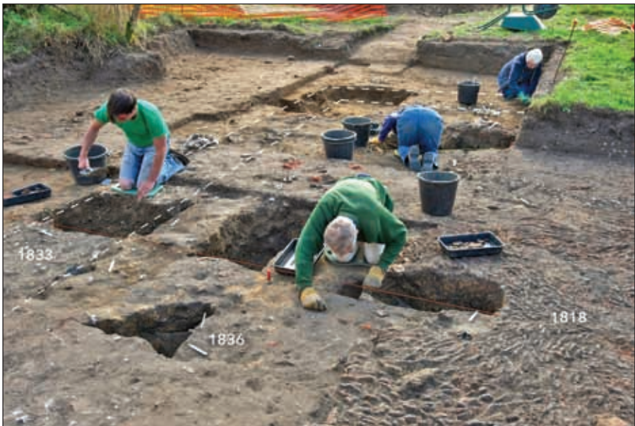
View of trench 18 showing the phase 2A hearth (1818 to right) with various phase 2B features under excavation within the robbed out kitchen wall 1833.

The new hearths were very distinctive, including a very blackened rectangular hearth likely to have been used for spit roasting, with next to it the base of a large oven. The