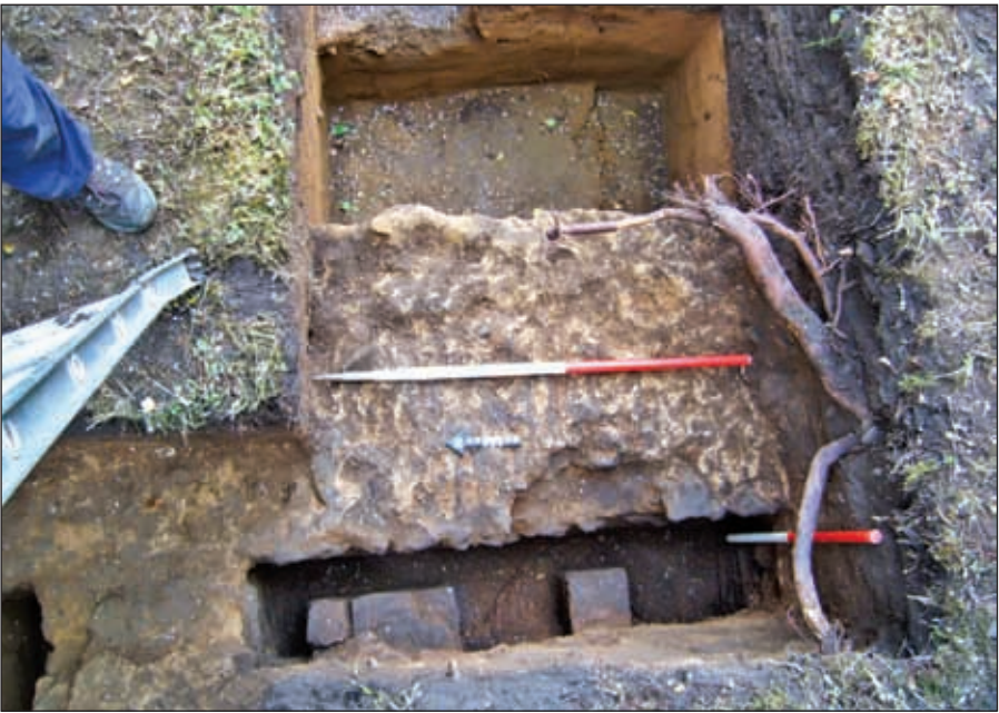
West end of trench 13; horizontal scale pole on main north-south wall, with pilae of heated room in the foreground and east-west return wall to the left.

To the south, trench 16 located another part of a heated room, this time almost completely robbed out right down to the well-preserved sub floor, on which traces of pila positions could be seen, with just one tile still in situ. On both east and west sides of the trench traces of walls were found positioned in a way that suggested there may have been an apse to the south, a theory also supported by irregularities in the pila positions. It is likely that this was a second room rather than a continuation of the