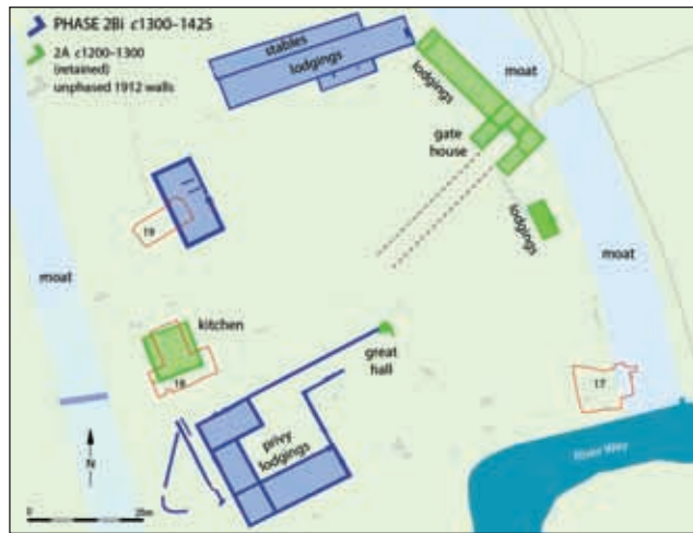
Provisional plan for Phase 2B (c1300-1425) of the manorial complex.

appointed as Valencian structures. Tiles were found in the demolition rubble. Its side walls are relatively narrow which indicates that they were sill walls for a timber framed building. Two wider and thicker brick pads were found set against the moat, perhaps forming a more substantial looking show front, with the objective of presenting an impressive façade to river traffic arriving at the site.