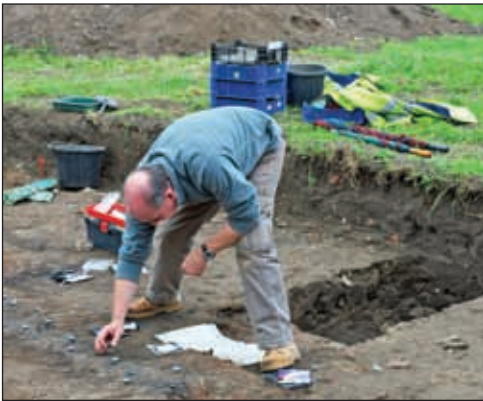
The phase 2B hearth (1854) with archaeomagnetic dating in progress.

kitchen was square and timber-framed above low stone walls, surmounted by a central louvre to extract smoke. It was detached from the main buildings because of fear of fire.