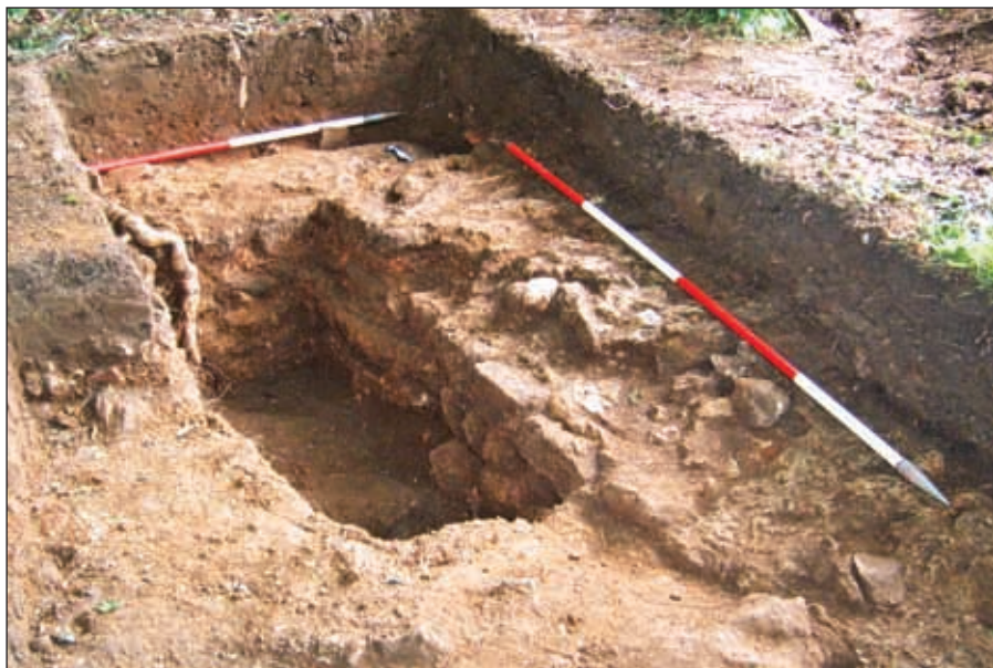
View of the wall join in Trench 14. Nearer the camera the more regular stonework of the later building wall can be seen cut into the pre-existing structure.

but turned to the south at a point where it had been cut into an earlier structure which was at a slightly different alignment, and is probably part of an earlier building. The later range's corner had been bonded into the wall of this earlier structure not far to the south of the latter's outside north-east corner, and the return wall of the earlier building was traced along the trench to the west to a point where it had been largely robbed out. There was some evidence suggesting that there had been rooms to the south but no cross walls could be located; a large amount of tile rubble with a high proportion of box tile fragments hinted at the former existence of heated rooms in the area. The wall's foundations had been stepped down the slope, so if the same roof and floor line was maintained, the rooms at the lower end would have been considerably above outside ground level. At each end of the trench parts of the 1990s excavation trenches were located, a valuable aid to overall surveying. This trench was supervised by Nikki Cowlard.