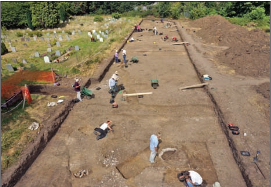
Church Meadow, Ewell 2014: Area J in foreground.

At the end of the 2013 excavation a small gully was noted to the west of the deep pit in Area J. Further investigation revealed a ditch of probable 1st century date, shallow and wide in profile, running across the trench in a north-east/south-west direction, roughly in line with the anticipated route of Stane Street across the site. This ditch