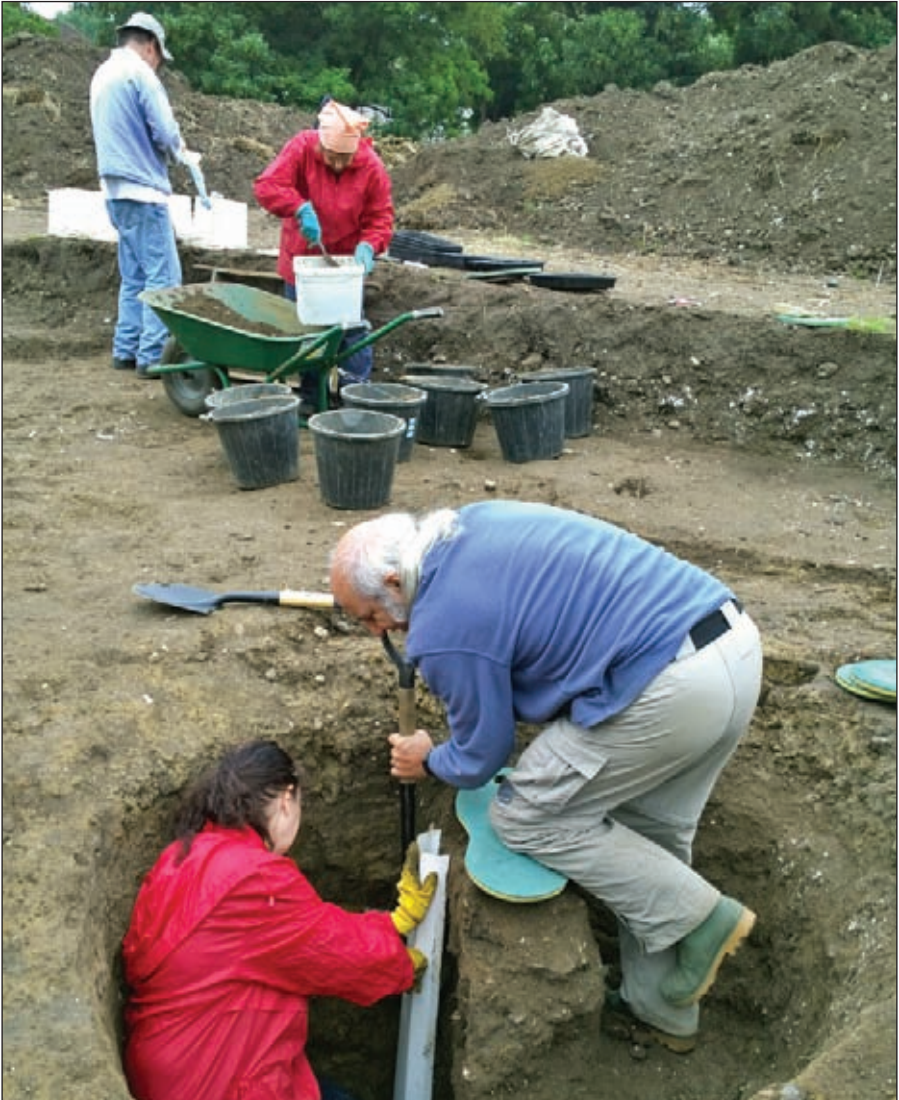
CHURCH MEADOW, EWELL 2014: Environmental sampling