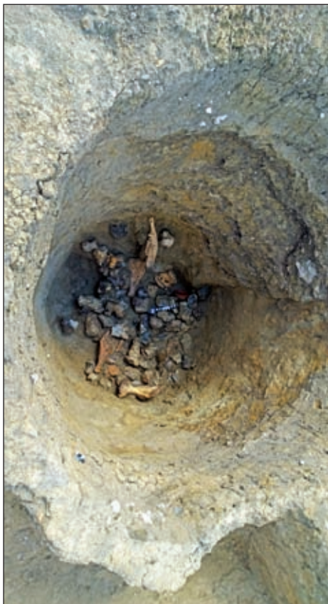
Ritual pit 241 with flint and bone deposits beneath clay lining.

Between the 'non-agger' and the eastern roadside ditch were areas of closely packed