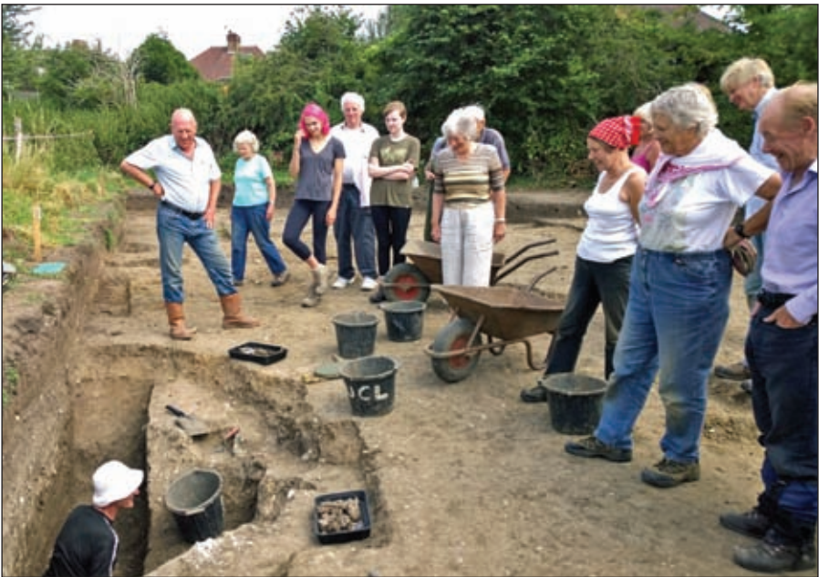
Team discussion on Pit 319.

Only the edge of the third pit 316 could be seen in the trench but it probably extended to a diameter of 2.5m. Two layers of fill were evident separated by a band of chalk and mortar fragments. The fills were same in appearance and consistency as those in pits 311 and 319. These pits, together with the amphora pit described below, share characteristics of repetitive use with some indication of mortar lining and burnt material. A mortar-lined flint bowl found in Area B in 2012 may also represent a similar function. It is likely that these pits had an industrial function and parallels are being sought. Environmental samples have been extracted from all the excavated pits and may give us an indication of what use they were put to.